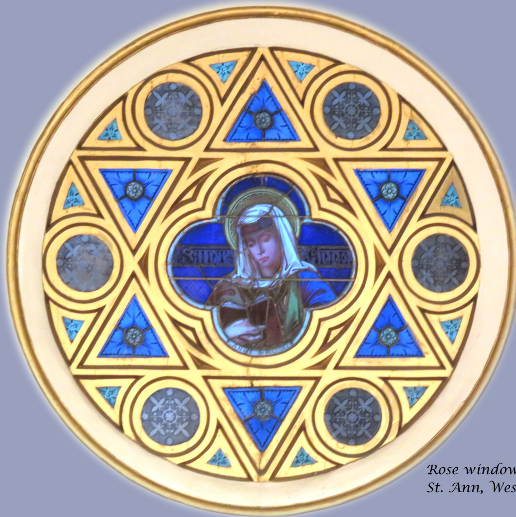
Rose window at St. Ann, West Newbury

St. Ann, Mother of the Blessed Virgin Mary, Pray for Us.